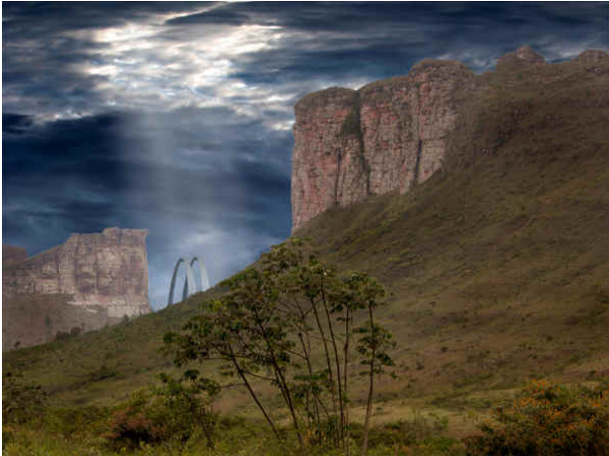
The Gates of Life in Kellindahr as viewed from the border of Qarth